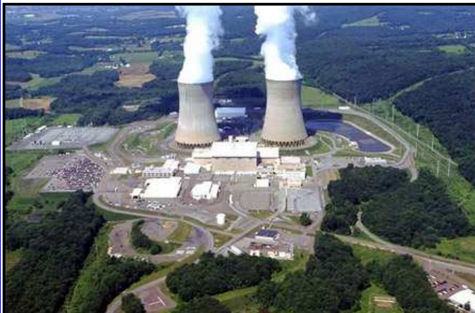
Figure #1 Dual Unit Nuclear Plant Susquehanna Steam Electric Station in Berwick, PA.

Except for a renowned University or National Library, who would believe that a Commercial Nuclear Power Generating Facility 1 would be a one of the best repositories for Scientific and Engineering knowledge? How is that possible you ask? You might be baffled at this point, but the answer becomes apparent when you consider several factors. Primary among these is that during the early stages of a concurrent design-construct